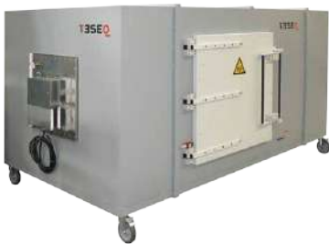
RVC XS with option EUT BOX-1 and 2x SIF RC