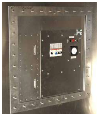
Option EUT BOX-1, DC1 and 2x SIF RC, view from inside

Teseq GmbH Landsberger Str. 255 · 12623 Berlin · Germany T +49 30 56 59 88 35 F +49 30 56 59 88 34 desales@teseq.com www.teseq.com