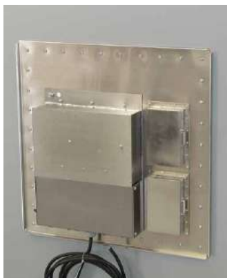
Option EUT BOX-1, DC1 and 2x SIF RC, view from outside