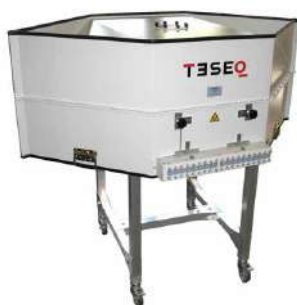
D-TEM-UCAR, D-TEM cell with under-carriage with locking casters