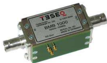
BMB 1000, LCL measuring bridge

Example for measuring the LCL on ISNs with LCL adapter with RJ45 or RJ11