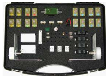
CAS ISN with all options in suitcase